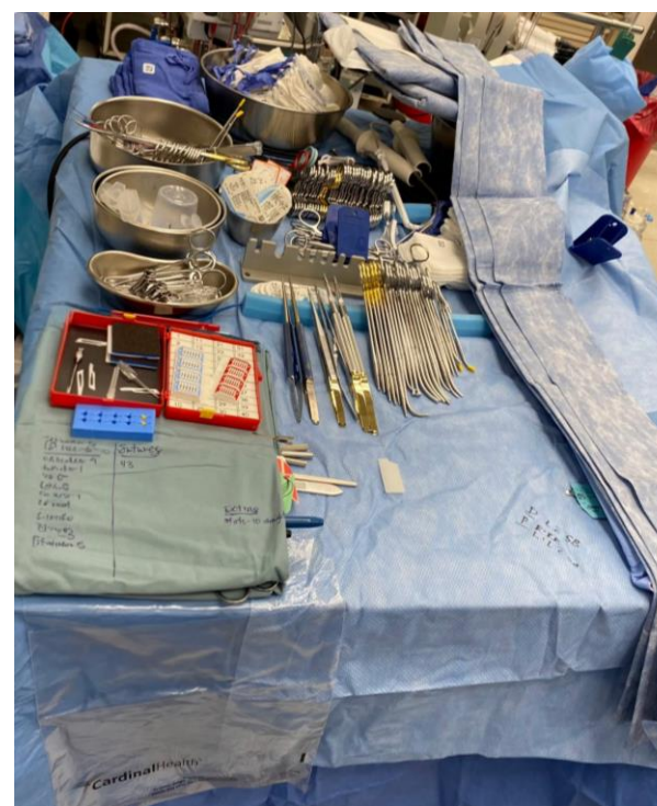
Mock Cardiac Table for Learning

Scenario-based practice allows participants to refine their skills under time constraints while receiving direct feedback from educators. The program incorporates anatomy and physiology refreshers to help bridge the gap between textbook learning and actual surgical visualization. Additional instruction focuses on essential perioperative concepts such as medication and specimen management, workflow practices, and OR-specific terminology.