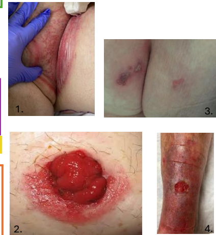
Case 1: Incontinence associated dermatitis of the left inguinal fold in a 64 year old male with long-term diabetes. Case 2: Peri-stomal dermatitis of loop colostomy impacting pouch adherence. Case 3: Peri-anal herpes / herpetic whitlow of the buttock Case 4: Contact dermatitis of the peri-wound, prior to HClO treatment

Visual Light Images demonstrating where rapid dispersion of HClO gel coupled with minimal casting are beneficial and alternative treatment vehicles (oils, creams, heavy gels) impact patient comfort, aesthetic perception, use, or adherence: