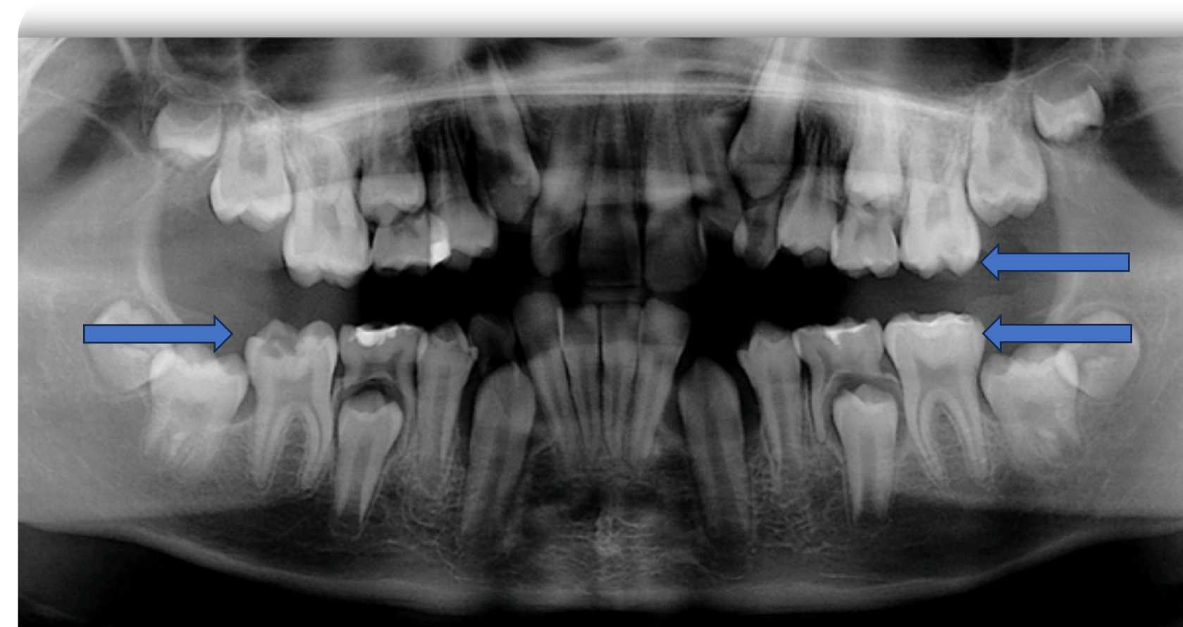
COD Pediatric Dentistry Dep Patient Axium Data