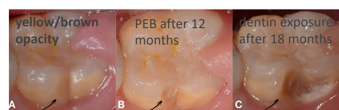
Cabral, R et al., 2020.

Molar-Incisor Hypomineralization (MIH) is a developmental enamel defect affecting one or more permanent first molars, often with associated involvement of incisors. Characterized by structural weakness, hypersensitivity, and increased risk of post-eruptive enamel breakdown (PEB).