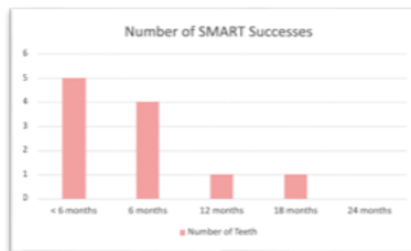
Figure 3: Number of SMART success cases in <6 mo, after 6 mo, 12 mo, 18 mo, and 24 mo from the 5 total success cases. Number of teeth are shown to be 5 teeth when followed less than 6 months, 4 teeth after 6 months, and 1 tooth after 12 and 18 months.

In summary, 14 restorations failed over the observation period, with a mean failure time of 11.9 \pm 6.3 months (median: 11 months; range: 2–20 months). Failures occurred most frequently at 6 and 20 months.