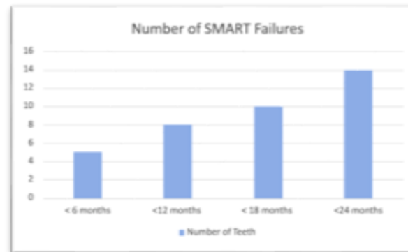
Figure 2: Number of SMART failure cases in <6 mo, <12 mo, <18 mo, and <24 mo intervals from the 14 total failure cases. Number of teeth are shown to be 5 teeth within 6 months, 8 within 12 months, 10 within 18 months, and 14 within 24 months.

Among the failure cases that needed retreatment after SMART restoration, 5 teeth had failed in less than 6 months, 3 teeth, in addition to the previous 5, had failed in less than 12 months, 2 additional teeth within 18 months, and 4 additional teeth within 24 months [Fig 2]. In the success cases, a total of 5 teeth had shown intact restoration with no need for retreatment [Fig 3].