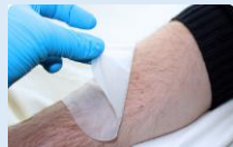
Figure 3: Hydrocolloid Technology